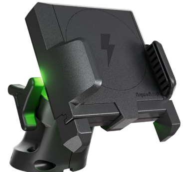
LED ARM MOUNTED