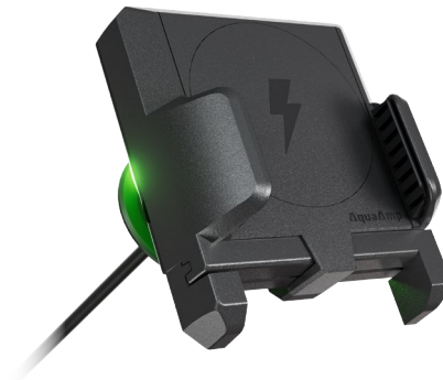
LED SLIM SOCKET MOUNTED